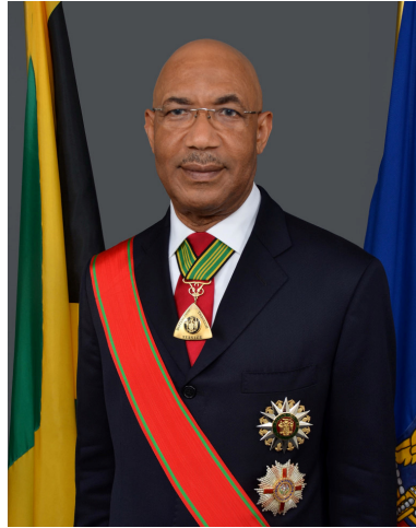
THE MOST HONOURABLE SIR PATRICK ALLEN ON, GCMG, CD GOVERNOR-GENERAL OF JAMAICA

Jamaica is pleased to be the host country for the 52 nd Annual West Indies Baptist Fellowship Conference and to welcome to our shores all our brothers and sisters representing Independent Baptist Churches across the Caribbean. It is my sincere wish that, in addition to accomplishing the business of the Conference, our warm Jamaican hospitality will make you feel right at home and that you will have the opportunity to experience our culture in some of its various manifestations.