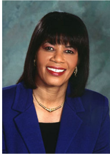
THE MOST HONOURABLE PORTIA SIMPSON MILLER, ON, MP PRIME MINISTER

I welcome to beautiful Hanover and to the warmth of our Jamaican hospitality all the delegates and participants who have gathered for the 52nd Annual West Indies Baptist Fellowship Conference. To those from overseas and especially those visiting Jamaica for the first time, I extend a special welcome. It is my hope that in between your hectic schedule of sessions, bible teachings and focus on topical issues which impact the Church, you will make some time to explore and enjoy some of what Jamaica has to offer.